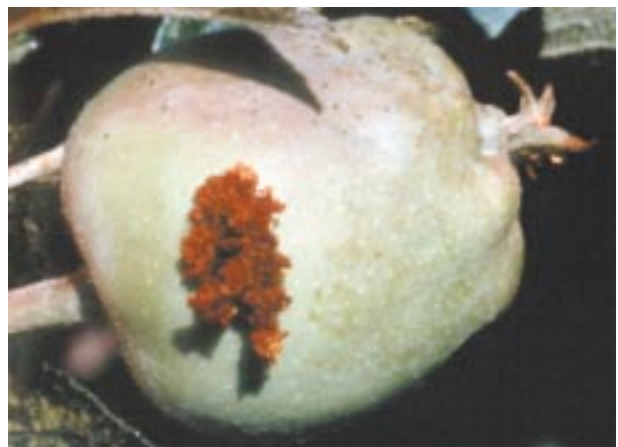
Fig. 8. Codling moth larvae leave granular brown excrement around entry hole.