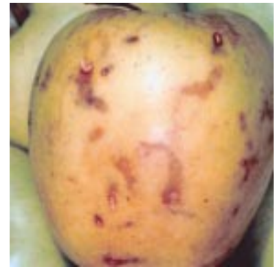
Fig. 4. Fruit damage created by tunneling apple maggots.

Apple maggot eggs hatch in 3 to 7 days as small (less than \frac{1}{16} inch), cylindrical, cream-colored larvae known as maggots. Maggots lack legs and visible head capsules, but have dark mouth hooks that protrude from tapered heads (fig. 3). As apple maggots tunnel through the apple flesh, they leave characteristic winding brown trails (fig. 4) that are best seen when the fruit is cut open (fig. 5). The first indication that a backyard apple tree is infested with apple maggot occurs when the homeowner discovers these brown trails in fruit at harvest. The maggots measure \frac{1}{4} inch long when fully mature. Fruit damaged by apple maggot becomes soft, rotten, and often drops from the tree.