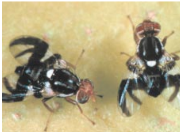
Fig. 1. Apple maggot adults.

Apple maggot adults are known as fruit flies (fig. 1). Female flies lay their eggs singly in apples and other fruits. This egg-laying activity begins in July and continues through early October. When laying each egg, the female makes a tiny puncture in the fruit and inserts the egg just below the skin. This initial fruit damage is easily overlooked, but eventually leads to fruit dimpling (fig. 2).