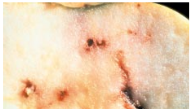
Fig. 5. Cross-section of an apple infested with apple maggot.

Authorities suspect that the apple maggot is transported and spread as maggots or eggs within infested fruit. To prevent further spread, quarantine areas are established around counties that have known apple maggot infestations. Highway signs posted along