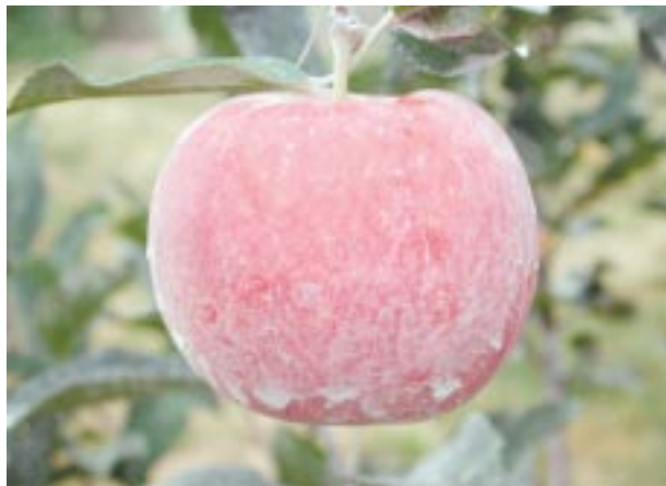
Fig. 11. A visible kaolin clay film must cover apple to be an effective insect deterrent.

One product homeowners may consider using for control of apple maggots is a kaolin clay (Surround At Home®). This clay product is not a true pesticide and is not toxic to apple maggot or other insects. These products form a barrier film that irritates insects and disguises the host. Insect pests avoid the kaolin-treated trees and fly to other potential host trees. Kaolin clay works best when the visible film barrier is established over the entire tree before fly activity begins. Begin applying kaolin clay by late June and reapply every 7 to 14 days, or more frequently if it rains, to maintain a good visible film on the apples (fig. 11). You can monitor apple maggots with sticky cards and begin applying kaolin at first fly catch. Apply Surround At Home® at a rate of 1/2 pound (about 3 cups) per gallon of water and spray onto tree until the product begins to drip from the leaves. Use enough product