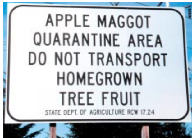
Fig 6. Apple maggot quarantine sign along highway.

some Washington routes read: “Apple Maggot Quarantine Area/ Do not transport home-grown tree fruit” (fig. 6). These signs are part of an educational effort to discourage homeowners and consumers from transporting backyard apples and fruits that may be infested with apple maggot. It is illegal for anyone to carry backyard or noncommercial tree fruit north into western Canada, south into Oregon or across the Cascade Mountains into the apple-maggot-free areas of eastern and central Washington. For more information on these quarantine programs, contact the WSDA at 1-509-225-2609.