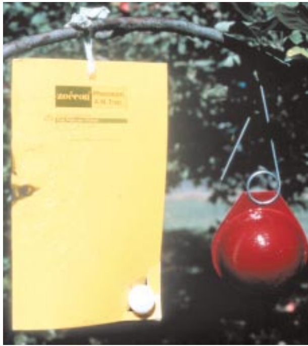
Fig. 9. A yellow rectangular sticky trap with an ammonia lure or a red spherical sticky trap work best for trapping apple maggot flies.