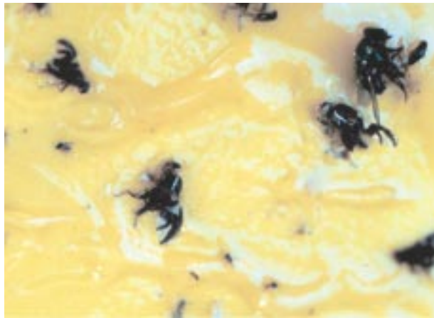
Fig. 10. Apple maggot and other flies captured on a yellow sticky trap.

wintering sites in the soil and fly into apple trees. Typically, growers and home-owners monitor for apple maggot flies to time their insecticide spray program. Most spray programs start within one week after the first apple maggot fly is captured.