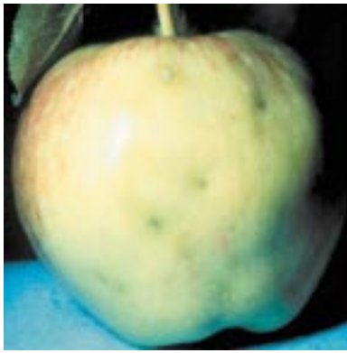
Fig. 2. Damage from apple maggot egg-laying activity.